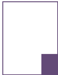
FRONT 2 col. x 6" 4.5625" x 6"