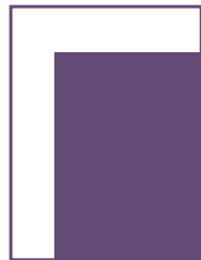
TAB PAGE 4 col. x 13.5" 8" x 13.5"