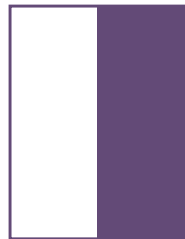
1/2 VERTICAL 3 col. x 21" 7" x 21"