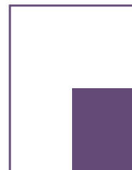
1/4 VERTICAL 3 col. x 10.5" 7" x 10.5