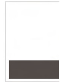
Quarter Page Ad 5 5/16" wide x 1 5/8" deep (available only in Court Reporter Section)