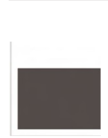
Half Page Ad 5 5/16" wide x 3 1/2" deep